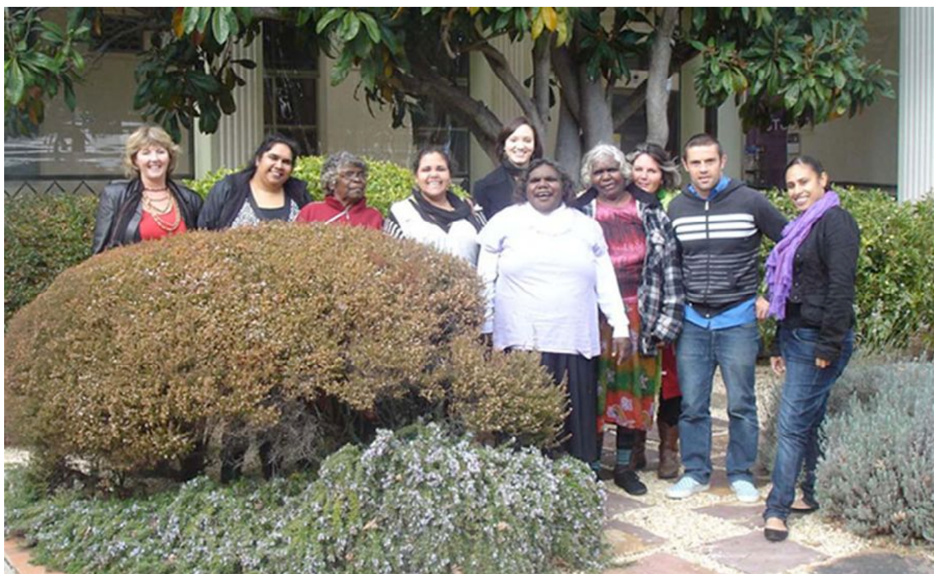
The Ara Irititja team with staff at National Film and Sound Archive, Canberra, 4 June 2010