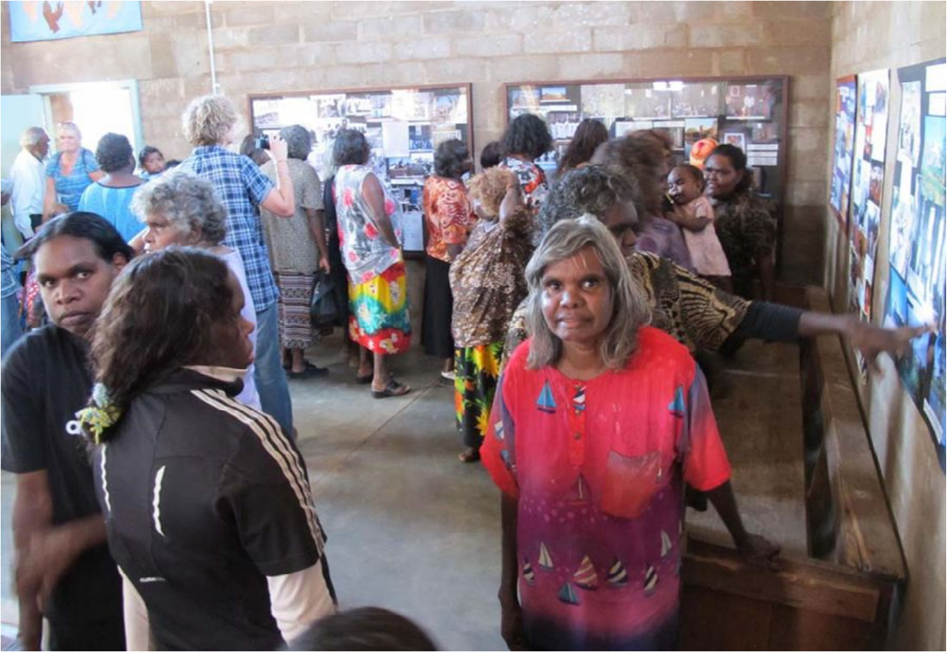
The historical photo display at the Ernabella Church celebrations, Pukatja, March 2010